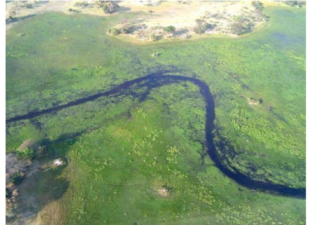
Above: Aerial view of the Okavango Delta, a Ramsar Wetland of international importance

Now it can help ensure those vital, flowing waters are shared for peace and security throughout the region.