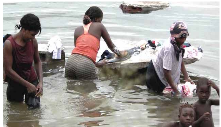
Right: Kuebe River near Lago de 1 Maio 15 km from Menongue