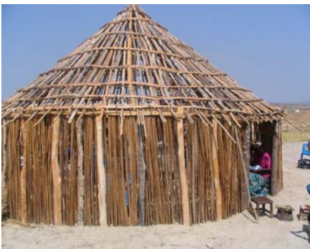
Above: Tribal administration office for the chief of Barragem at Kambumbe River.

Finally, a United Nations Development Programme – Global Environment Facility (UNDP-GEF) project aims to strengthen the mechanisms for joint implementation, develop a transboundary diagnostic analysis and formulate a Strategic Action Plan for the Okavango Basin.