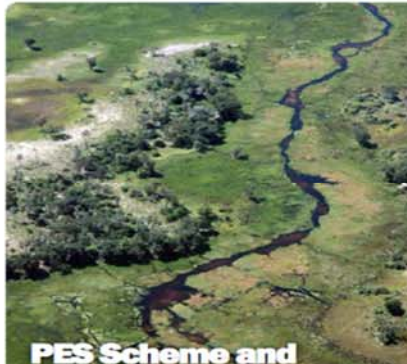
Endowment Fund for the Cubango-Okavango River Basin

The Cubango-Okavango River is among the most intact rivers in the world. It is under threat from human development and the impacts of climate change.