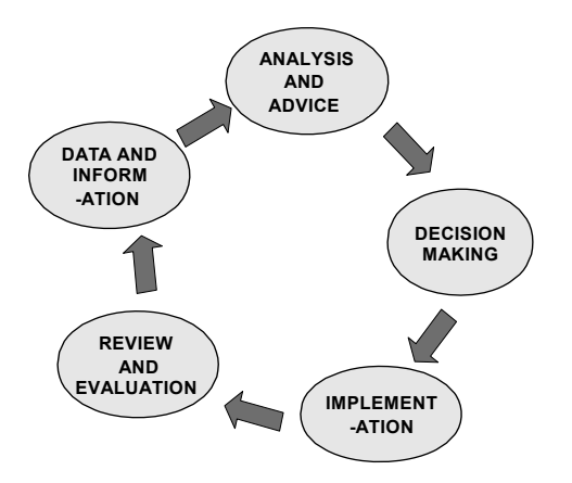
Figure 1. Generic policy cycle.